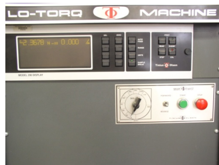
Figure 1.2.4. Torsion controls.