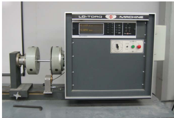
Figure 1.2.1. T-O Lo-Torq torsion machine