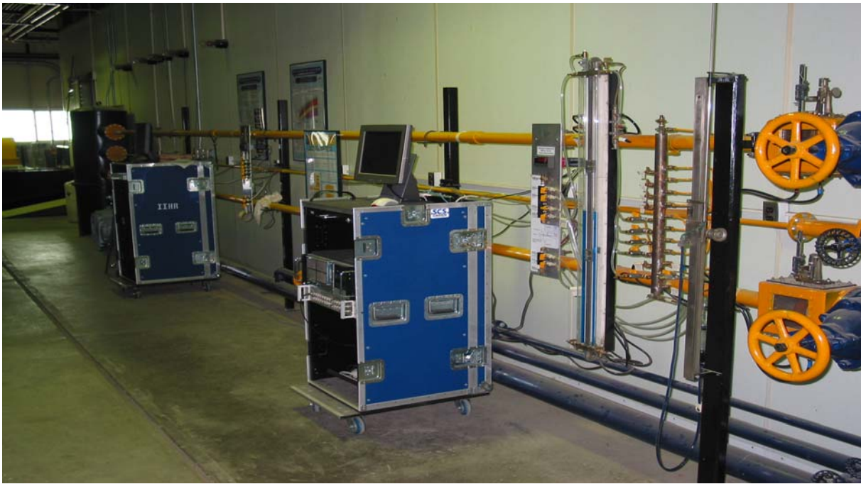
Fig. 3 Pipe flow experiment

data reduction for the velocity measurements based on the Bernoulli equation applied to Pitot tube measurements, with separate readings of the stagnation and static pressures. The above mentioned pressure measurements, can be done in two ways. First method is to read pressure with a simple manometer while the second one uses a pressure transducer controlled by a computer-based automated data acquisition system developed with LabView software. The students use the first method during the prelab for demonstration purpose and the second method for acquiring data during the labs.