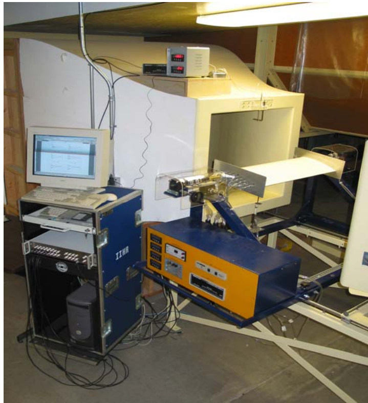
Fig. 4 Airfoil flow experiment

mounted in a closed circuit open test section wind tunnel shown in Fig. 4. The airfoil is provided with 29 pressure taps located in an airfoil cross section. The measured pressures used to calculate the pressure and lift coefficients. Pressure and lift coefficients are normalized with the free-stream velocity. Integration of the measured pressure distribution over the airfoil's surface used to calculate the lift force. Bernoulli equation used to determine the free stream velocity measured with a Pitot tube. The lift force independently measured with a load cell. Lift coefficients calculated for Re = 143,000 and several angles of attack up to the stall angle.