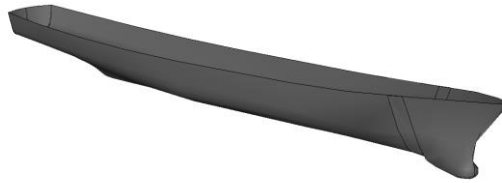
Figure 1: DTMB 5415 geometry.

Additional analyses of the Four-dimensional particle tracking velocimetry (4DPTV) static drift \beta = 10 deg results for the 5415 sonar dome vortices have been done to realize its full potential for the assessment of the turbulence structure and vortex breakdown and interactions and for providing data for scale resolved computational fluid dynamics (CFD) validation.