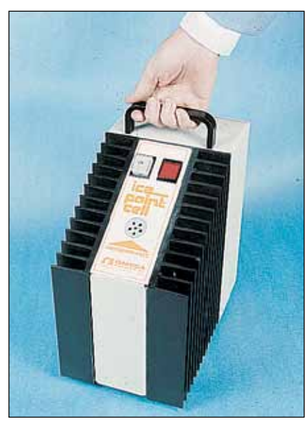
Sturdy handle for easy portability.